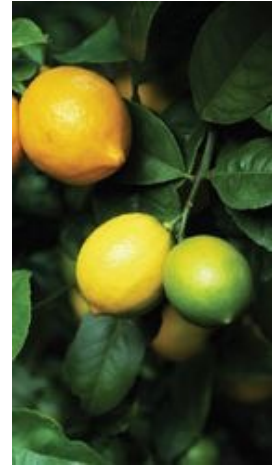
Lemon trees grow in tropical rain forests.